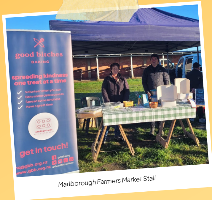
Marlborough Farmers Market Stall