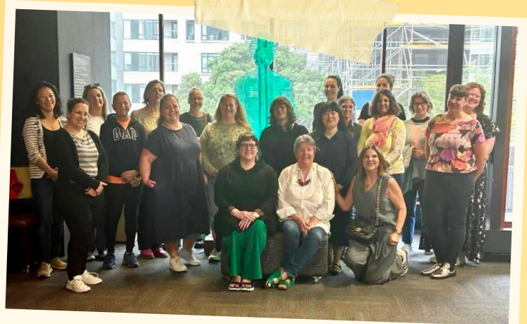
Wellington Chapter tour of He Tohu