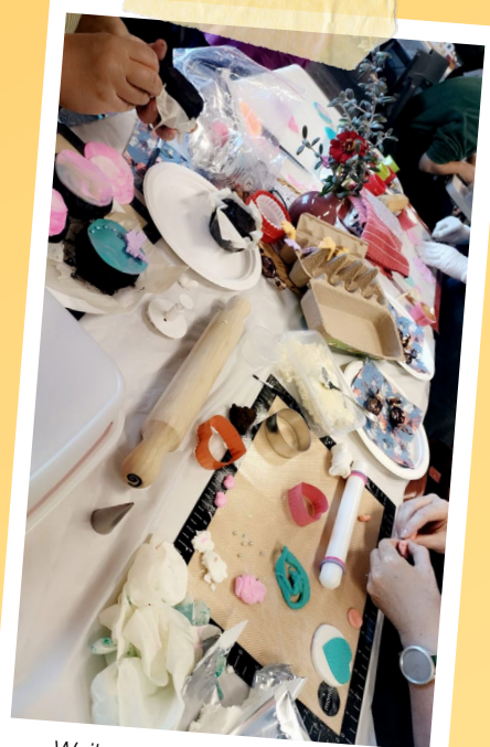
Waikato Mother's Day cupcake decorating event