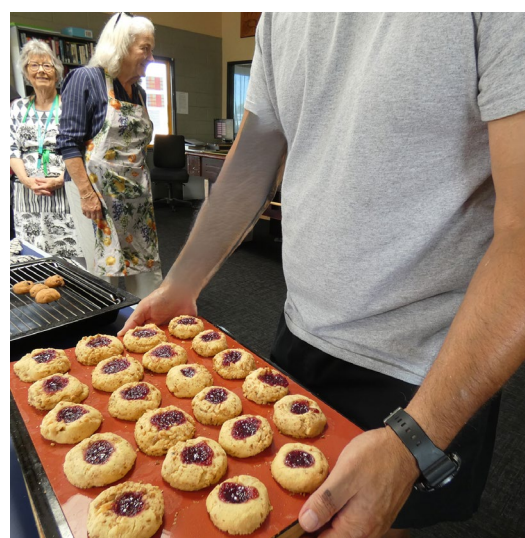
At Hawke's Bay Regional Prison