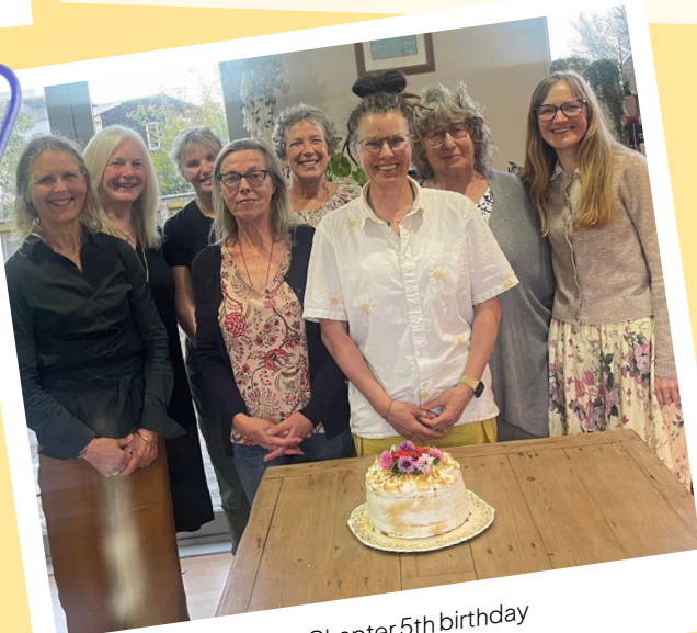
Gisborne Chapter 5th birthday