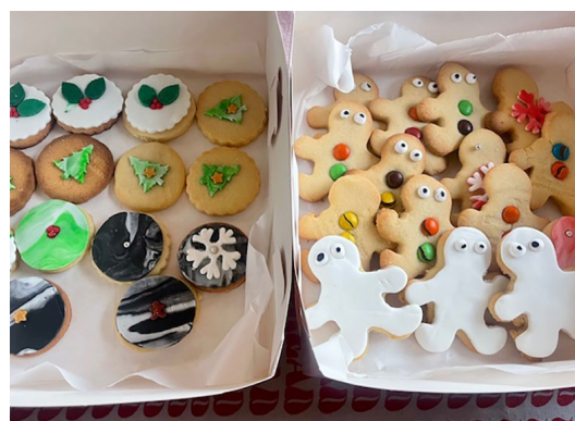
Waikeria Christmas session